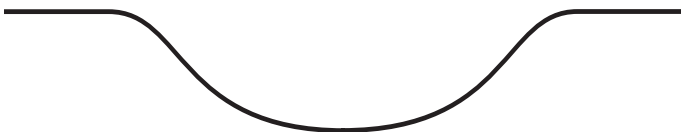
Illustration B: Taper/cove – USE!