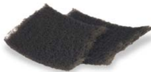
Gray scuff pads

3835( ) PLASTIC/LEATHER PREP or 38464 WORLD CLASS™ VINYL/PLASTIC PREP