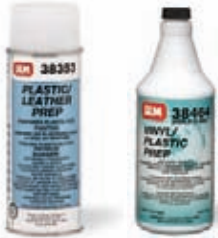
3835( ) PLASTIC/LEATHER PREP OR 38464 WORLD CLASS™ VINYL/PLASTIC PREP