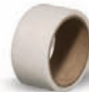
70006 PLASTIC REPAIR REINFORCING TAPE

Skims over multiple substrates filling sand scratches and other minor imperfections. 39482 dispenses easily and spreads smoothly.