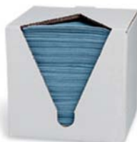
Lint free towels