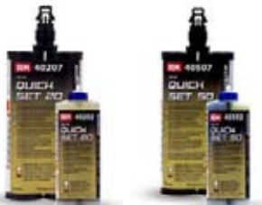
4020( ) QUICK SET 20 or 4050( ) QUICK SET 50