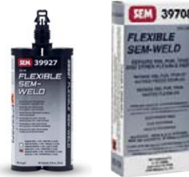
39927 FLEXIBLE SEM WELD or 39708 FLEXIBLE SEM WELD