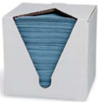
Lint free towels