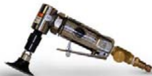
Grinder with 36-40 grit disc

4 Cut a piece of 70007 PLASTIC REPAIR CONTOURING TAPE twice the length of the repair.