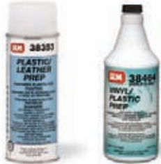
3835( ) PLASTIC/LEATHER PREP or 38464 WORLD CLASS™ VINYL/PLASTIC PREP

1 Clean thoroughly with 3833( ) SCUFF & CLEAN and a clean gray scuff pad. Rinse with water and dry.