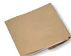
320-400 grit sandpaper