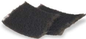
Gray scuff pads