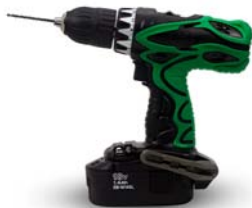
Drill with 1/8" bit