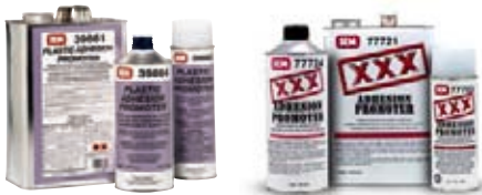
3986( ) PLASTIC ADHESION PROMOTER or 7772( ) XXX ADHESION PROMOTER