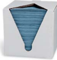
Lint free towels