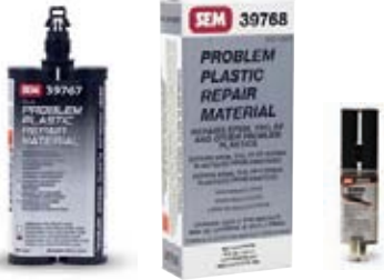
3976( ) PROBLEM PLASTIC REPAIR MATERIAL or 68422 MINI MAX BUMPER REPAIR MATERIAL

For ABS, TPO, PP, PPO, EPDM, TEO or TPE use: