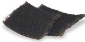
Gray scuff pads