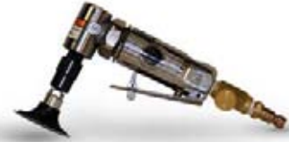
Grinder with 24 grit disc